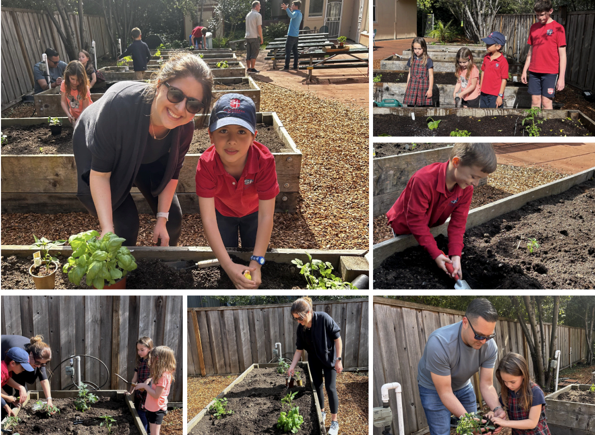
Volunteers plant seedlings in our garden beds behind the library and TK classroom.